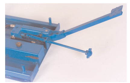
Removable & storable operator's foot pedal and lowering control on basic models.

Optional foot pedal switch available on electric models.