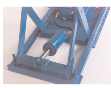
Superior hydraulic systems proven on a range of Bishamon lift products